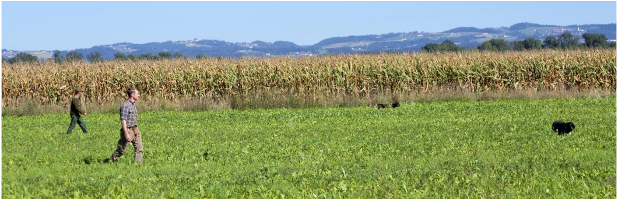
Search in pairs — a special challenge for two hunting dogs

pointing located game and honoring the point of the partner dog. After this subject, the dogs of the A-variation were tested on a down stay during a driven hunt for calmness and stability during gunfire. At lunch handlers were able to refresh themselves and talk about the completed test.