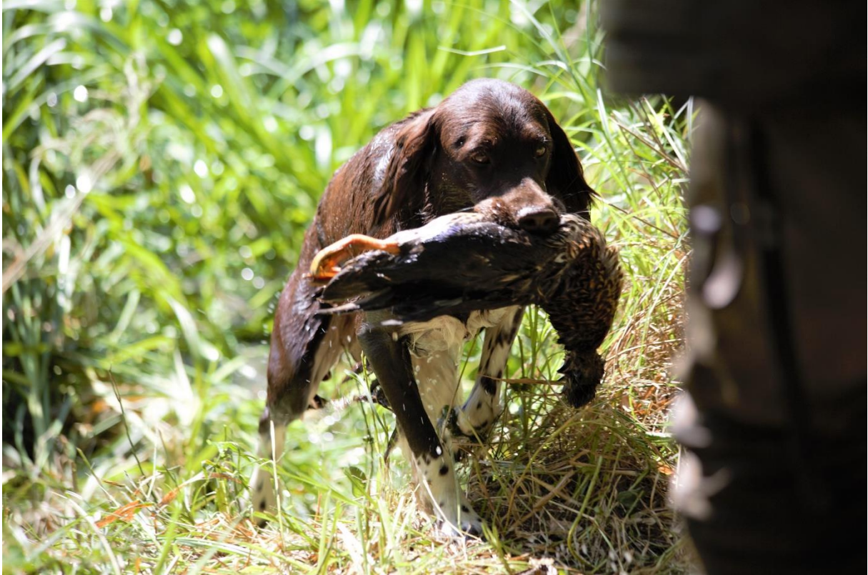
Water work — duck retrieve and testing gun sensitivity

pointing located game and honoring the point of the partner dog. After this subject, the dogs of the A-variation were tested on a down stay during a driven hunt for calmness and stability during gunfire. At lunch handlers were able to refresh themselves and talk about the completed test.