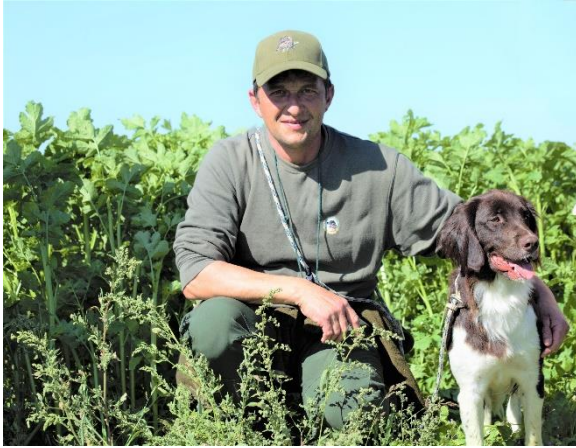
The best looking dog