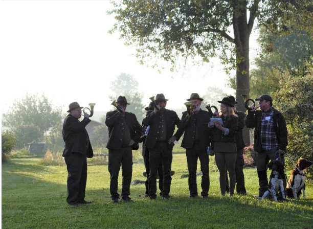
Welcoming the participants