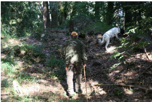
Underway on a hilly blood track

On Friday, all participants completed a very well-organized test program in the subjects field, forest and water. Blood tracks were also worked, parts of which were laid and tracked with considerable physical effort. There were